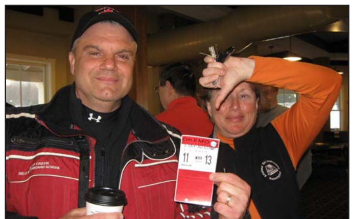
Anyone for skiing in the rain?